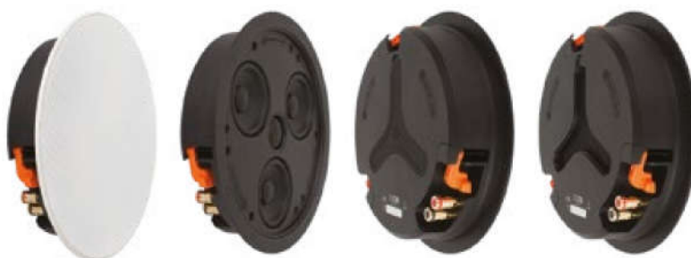
Closed back Opened back